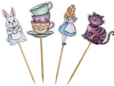
CUPCAKE STICKS - R7