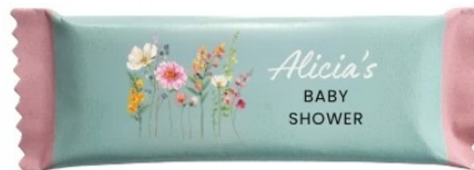
CTHEMED CHOCOLATE - R16 two finger kit-kat