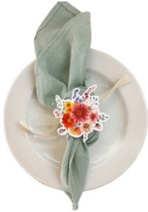
THEMED NAPKIN TAGS - R7