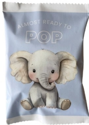
THEMED CARAMEL POPCORN - R25