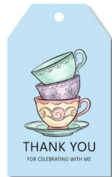
THANK YOU TAGS -R7