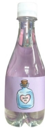
THEMED WATER - R18 330ml still water